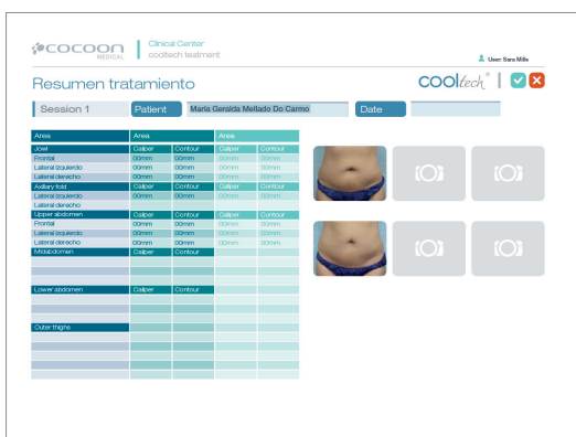
cooltech® patients' follow up report