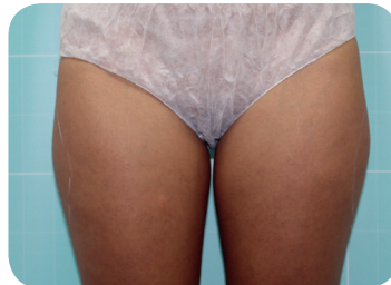
Applicator used: Oval HP Date: July 2015