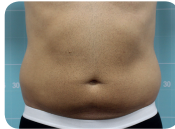
Applicator used: Curved HP Date: July 2015