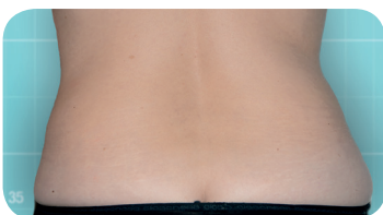
8 weeks later 6 cm lost