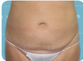
6 weeks later 14 cm lost