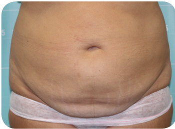
Applicator used: Double HP Date: July 2015

The cooltech® device complies with the European CE 0051 medical certificate, in addition to the ISO 9001 quality certification and ISO 13485, a quality standard specific to medical devices.