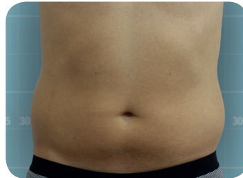
6 weeks later 6 cm lost