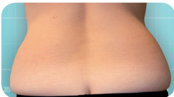
Applicator used: Straight HP Date: July 2015